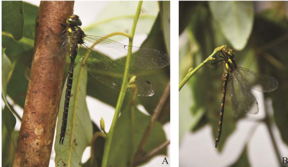
Figure 2. Cephalaeschna zhuae sp. nov, holotype, ♂. A. Body, dorsal view; B. Body, lateral view.