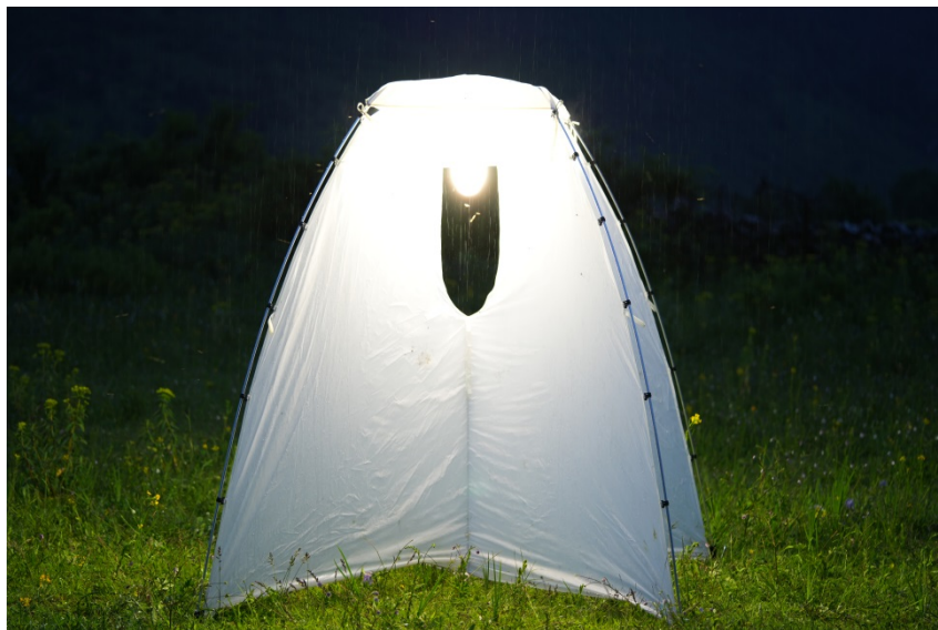
Figure 3. Habitat photo of light trap for O. jilongensis sp. nov.

Holotype. ♂ (IZCAS), China , Xizang, Jilong, Kongsangqiao, 2,671 m, 29-VI-2023, coll. Gongga, Baima & Nima, IZCAS slide no. Geom-07154. Paratype. 1♂, same data as holotype, IZCAS slide no. Geom-07171. The photo of the light trap at Jilong Valley is shown in Fig. 3.