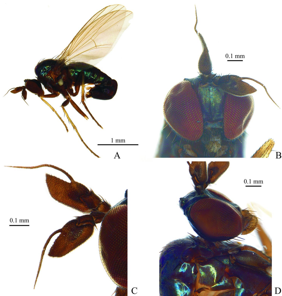
Figure 1. Hercostomus nimbosus Liu & Yang sp. nov. , holotype, ♂. A. Habitus, lateral view; B, D. Head, anterior and lateral views; C. Antenna, lateral view.

weak ad at base, 2 ad, 2 pd, and 3–4 apical bristles. Hind tibia with 2 ad, 2–3 d, 3–4 apical bristles. Relative length of tibia and 5 tarsomeres of legs LI : 4.8 : 2.5 : 1.1 : 0.9 : 0.7 : 0.8 ; LII : 5.4 : 3.6 : 2.1 : 1.4 : 1.1 : 1.1 : 1.1 ; LIII : 7.1 : 2.1 : 1.5 : 1.5 : 2.3 : 1.5.